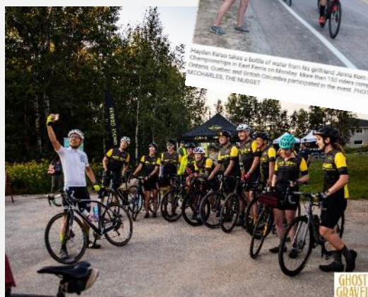
2022 Ghost Gravel in South River