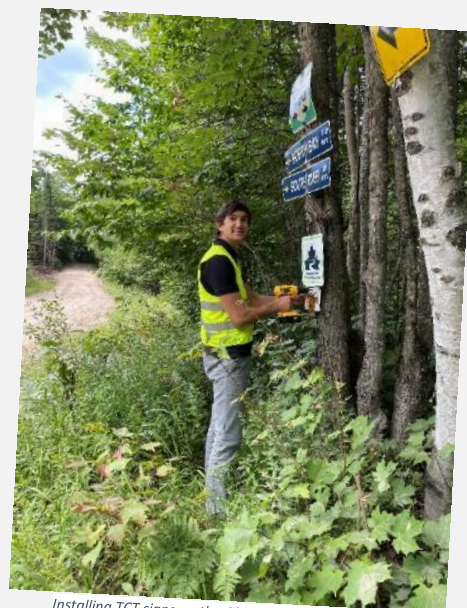
Installing TCT signs on the Old Nipissing Ghost Road

We are the Master Policy holder providing $5 million coverage to Trail Partners named on the policy including Friends of Laurier Woods , Almaguin Community Trails , Forgotten Trails Association , and new trail partner, Trees for Nipissing .