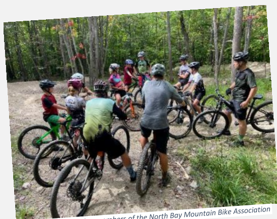
Emily Batty meeting members of the North Bay Mountain Bike Association

Cycling events across the region are attracting 100's of cyclists to the region. We are thrilled to support these events including Ghost Gravel, Ontario Cycling Championships, and Angry Johnny's Mountain Bike Race Series in North Bay and Almaguin . We support these events through resource sharing and promotion.