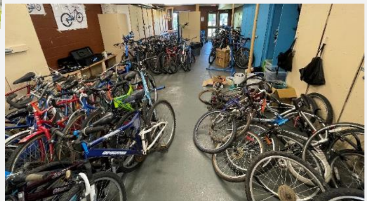
ReCycle Bikes workshop at Laurentian Ski Hill Lower Lodge

With expertise in cycling infrastructure, Discovery Routes has an advisory role on the North Bay Active Transportation Advisory Committee . This committee has influenced new sharrows, bike lanes, bike box and share the road signs on North Bay streets.