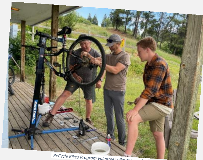
ReCycle Bikes Program volunteer bike mechanics