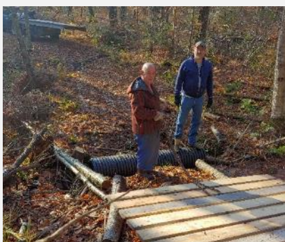
Almaguin Community Trail volunteers

Working in partnership with the Near North Trails Association and Trans Canada Trail , we continue to work to secure public access to the former CN rail trails: Beachburg Line and Newmarket Subdivision.