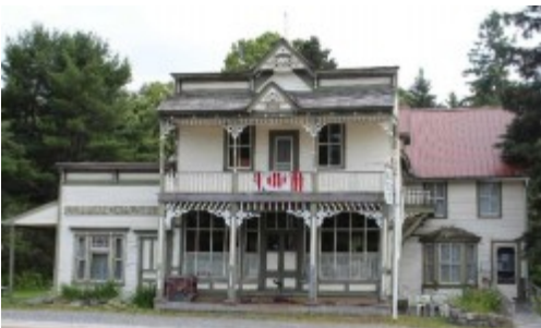
Commanda Heritage Centre

The loop includes some excellent and scenic paved and gravel connections.