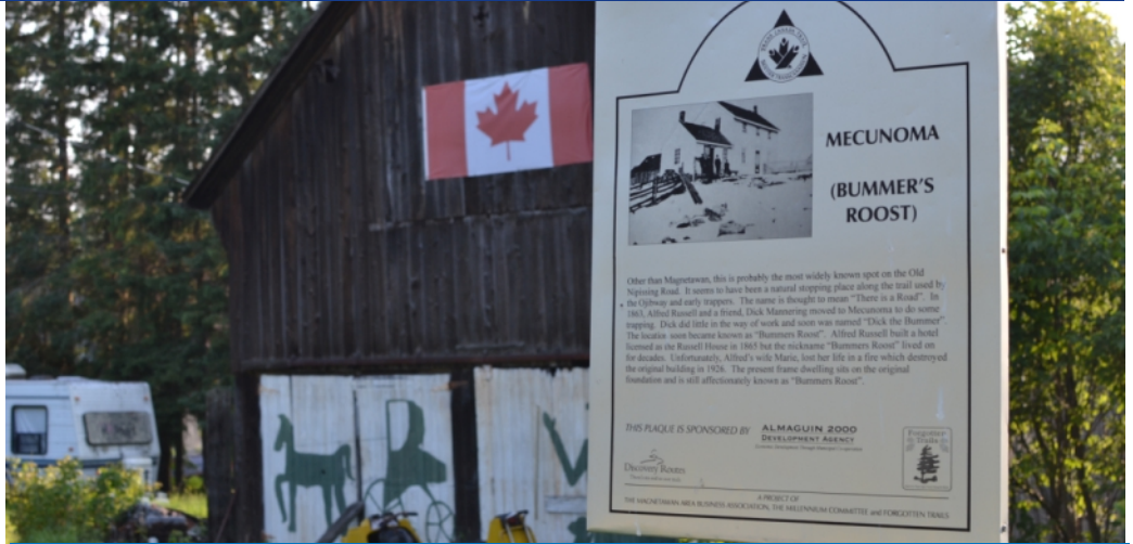
Historic plaques line the Old Nipissing Road.