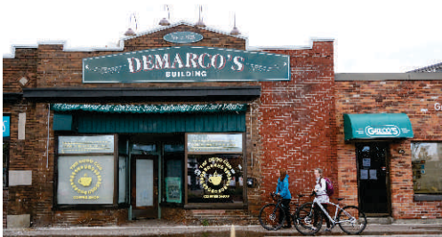
North Star Diner in the historic Demarco's building with its quirky artwork and eccentric décor, is well worth a visit.