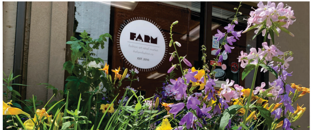
Downtown North Bay has colourful murals and unique shops and art galleries celebrating local arts, hand-crafted wares and Northern cuisine.

The route follows quiet secondary highways with wide paved shoulders and gentle ups and downs. Heading east towards Astorville along the Voyageur Cycling Route is another option with a loop back through the community of Corbeil along the wide paved shoulders of Hwy 94.