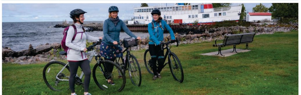
Lake Nipissing is a great inspiration to the arts community.

Outdoor bike stands with basic tools are located in Callander and Astorville. Full service bike shops in North Bay.